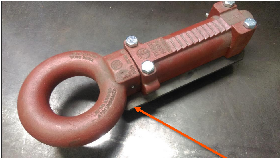
ANTI SWIVEL PLATE